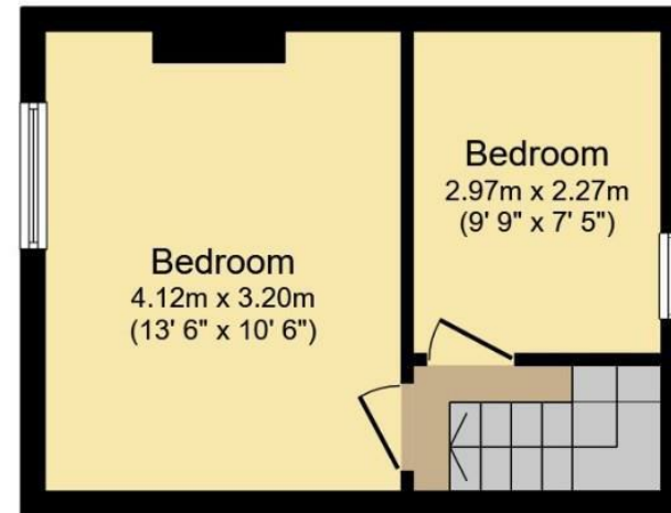
First Floor Floor area 22.8 m 2 (246 sq.ft.)